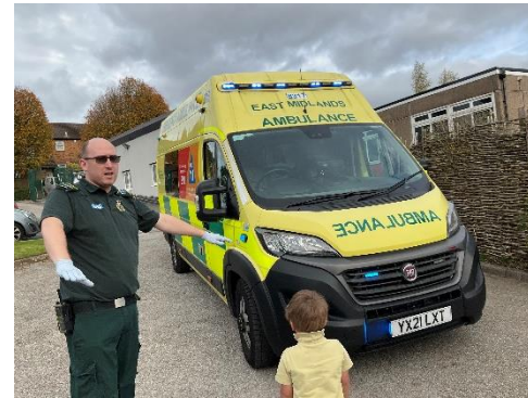
Learning about people who help us