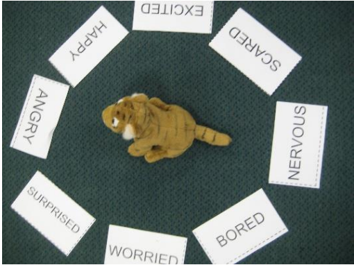
A game exploring feelings

We use the amazing book 'The Colour Monster' to explore feelings in F2