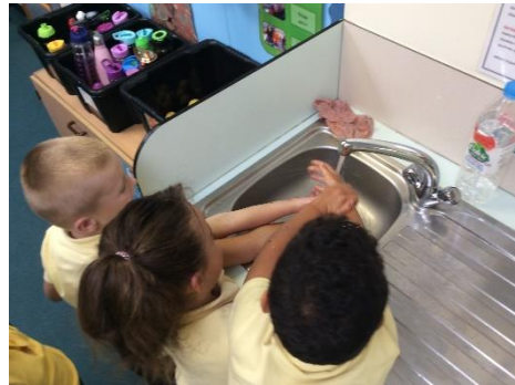
An investigation demonstrating the importance of hygiene and hand washing