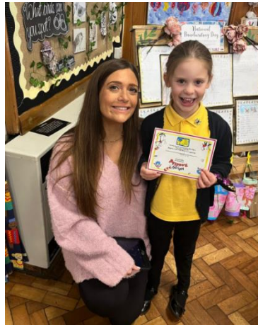
Celebrating achievements with our loved ones