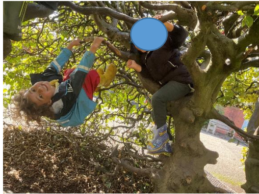
We learn to care for the environment and living creatures

Responsibility Resilience Independence Curiosity Respect Kindness Honesty Self-belief