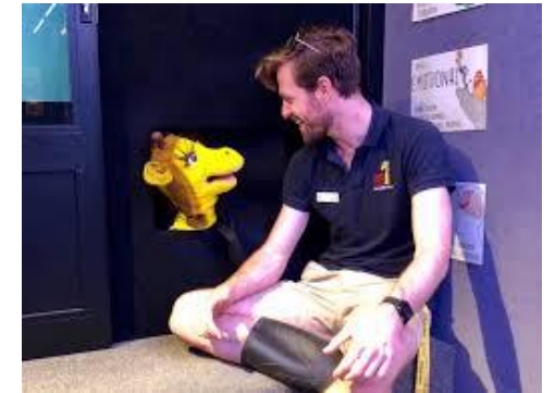
Relationships and friendships are a priority