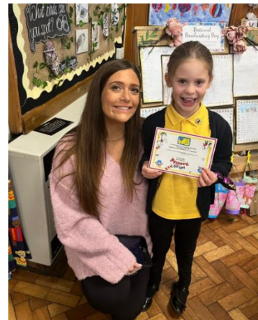
Celebrating achievements with our loved ones