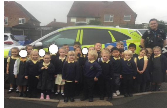
Learning about people who help us