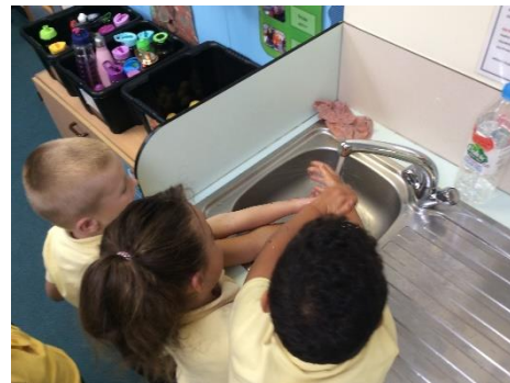
An investigation demonstrating the importance of hygiene and hand washing