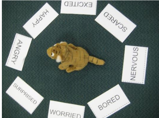
A game exploring feelings

We use the amazing book 'The Colour Monster' to explore feelings in F2